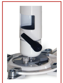
Ratchet Handle Adjustment